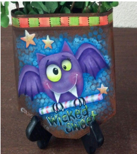
September's project with Sandy Le Flore

To reserve your spot call Sue Clark, (760) 961-9437 /760-265-4453 or Lynda McLain 760-868-2127/760-218-9273