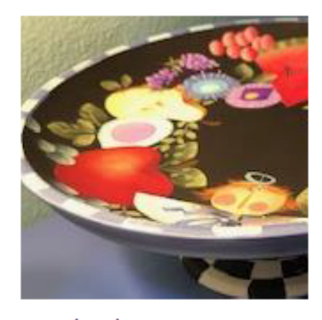
Comes in 3 pieces