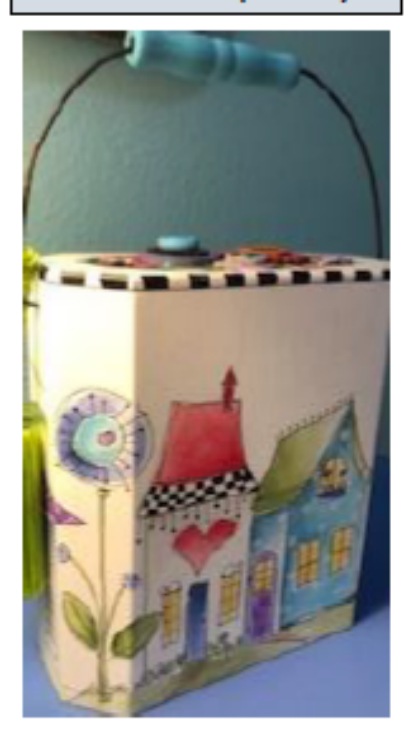
Flowery Neighborhood Bucket 9" tall x 9" wide x 4" deep and...LID with flowers!