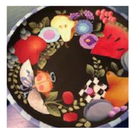
Fruit on a Pedestal Bowl 12"round

Pedestal class on Friday March 27 Bucket Class on