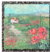
Sandy McTier Acrylic