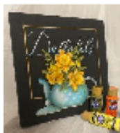
Tracy Moreau Acrylic