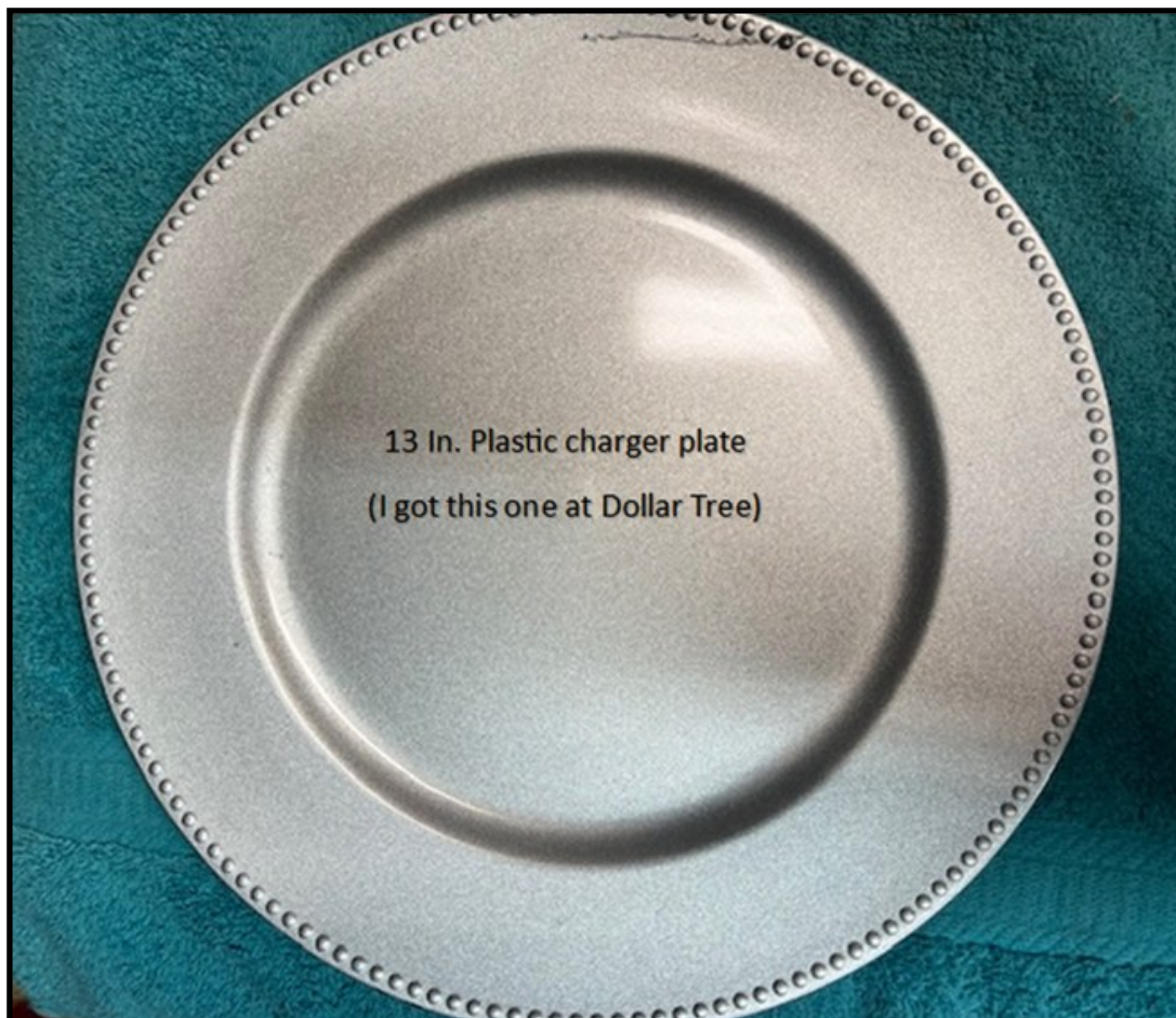
13 In. Plastic charger plate (I got this one at Dollar Tree)

Don't miss this fantastic opportunity to paint, learn, and connect! We can't wait to see you there!